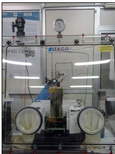
Fig. 1. INRIM's FTIR spectrometer (Thermo Fisher Scientific Nicolet iS50), equipped with a 10 m gas cell.

The FTIR spectrometer used at INRIM is a Thermo Fisher Scientific Nicolet iS50, equipped with a 10 m gas cell, shown in fig. 1.