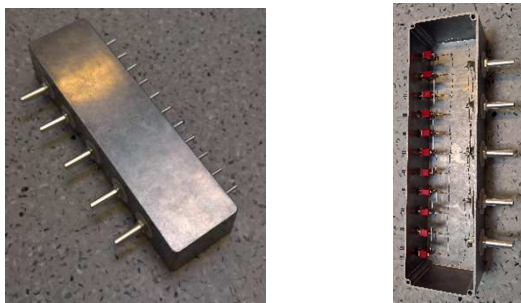
Fig. 3. Trescal design of series-parallel capacitance device.

The setup is subject to two significant systematic errors. When comparing non-equal impedances the linearity error of the main detector, D3, directly affects the impedance ratio. A method to determine the error of the digitizer and correct for it on a sufficient level of accuracy has been presented for high frequency impedance bridges [9]. A series-parallel capacitive device has been constructed to measure the D3 linearity error, but is yet to be tested, see figure 3.