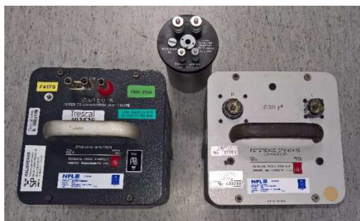
Fig. 1. Impedance standards. Left: General Radio 10 mH Standard Inductor. Centre: Tinsley 100 ohm AC/DC Standard Resistor. Right: General Radio 1000 pF Reference Standard Capacitor

Calibration of artefact impedance standards such as standard capacitors, standard inductors and AC resistors, (figure 1) has been carried out for decades on the primary level. These calibrations have mainly been performed at well-established National Metrology Institutes (NMIs) in the field of DC resistance and impedance metrology. In the field of electrical measurement there is an ever growing need for precise and accurate capacitance and inductance measurements, that are traceable to the SI.